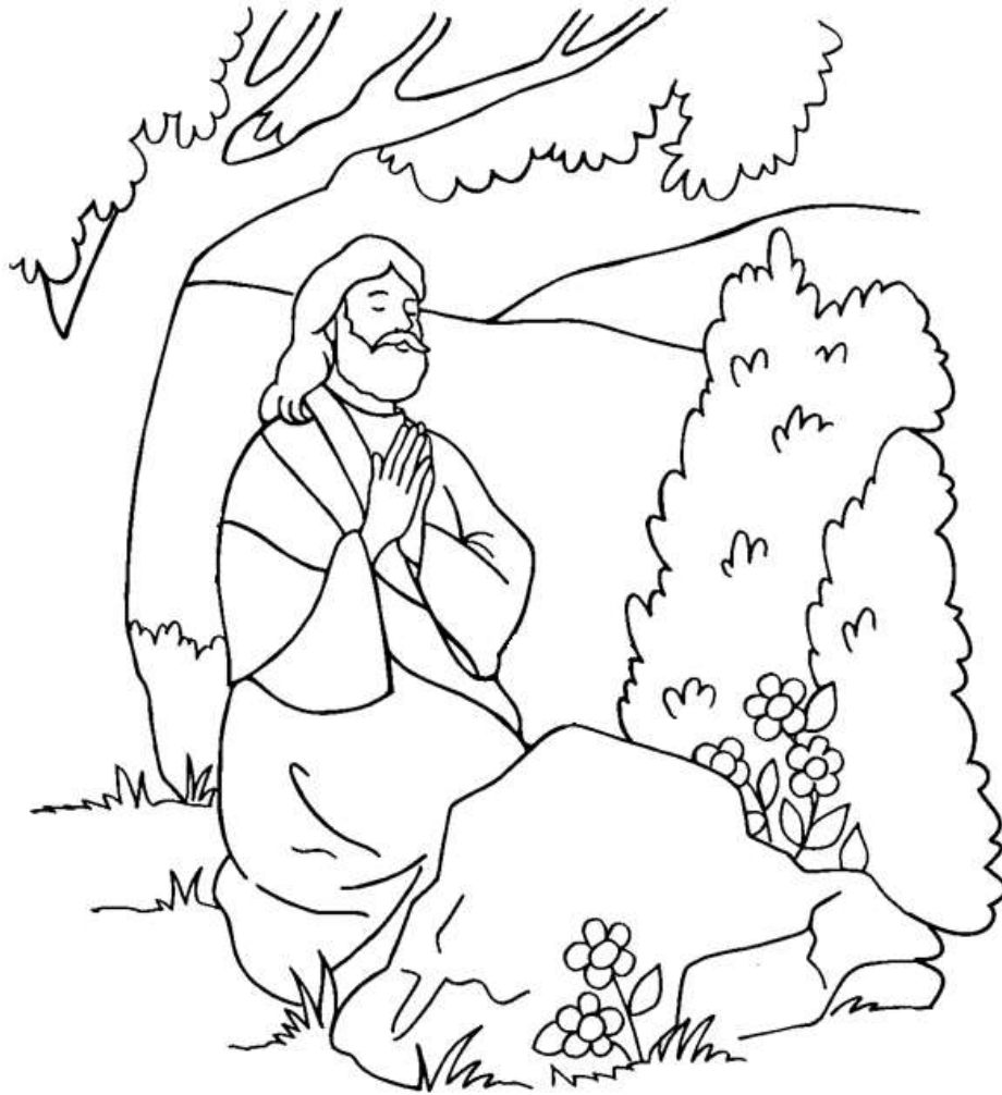
Jesus Prays for His Disciples