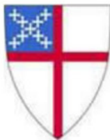
The Episcopal Church